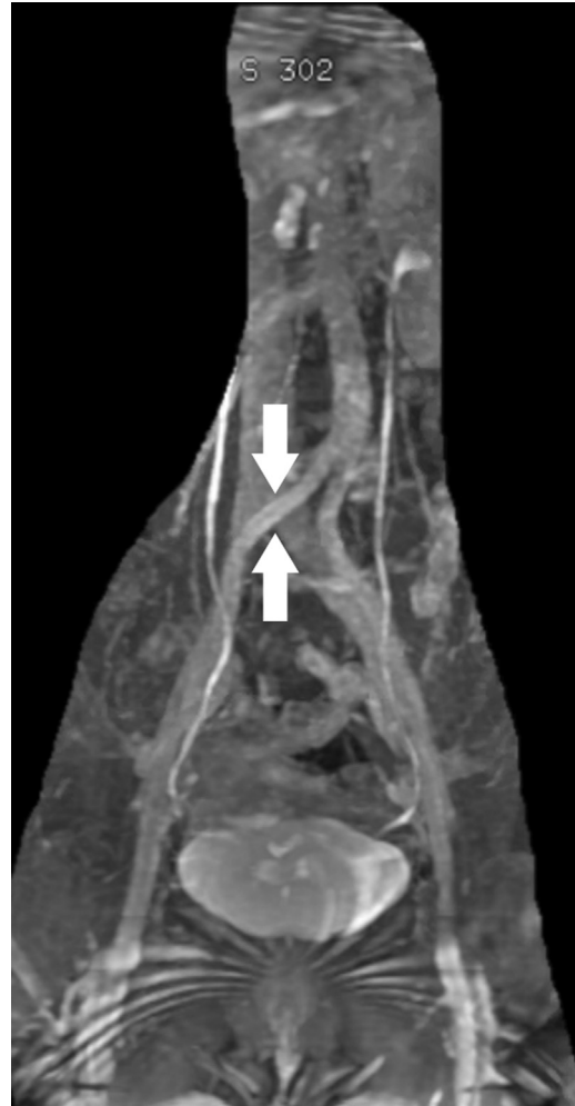
Supplementary Fig 2 (online only). Time-of-flight magnetic resonance venography (MRV) sequence showing course of the right common iliac artery as it crosses the left common iliac vein (CIV) causing venous compression syndrome (arrows).