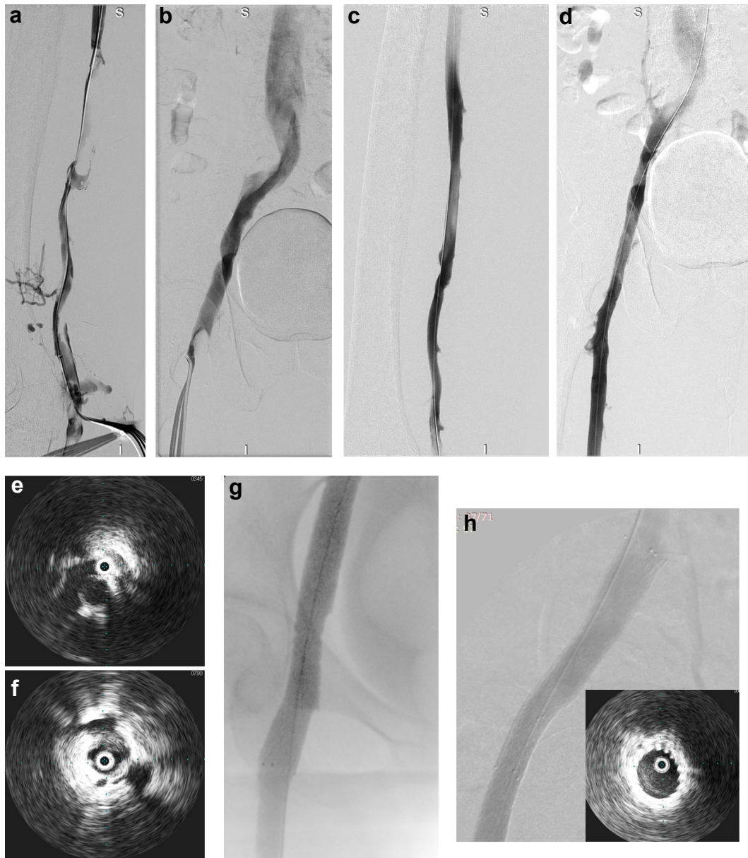
Fig 1. Iliofemoral deep vein thrombosis (DVT) intervention, thrombectomy, and stenting. a , Left popliteal access with the patient in a prone position, venogram indicating femoral vein thrombus. b , Venogram through the catheter positioned in the distal common femoral vein (CFV), indicating some thrombus in the CFV and a diseased common iliac segment. c,d , Post-thrombectomy venogram using the ClotTriever Thrombectomy System (INARI Medical); the vast majority of thrombus has been removed. e,f , Intravascular ultrasound (IVUS) imaging confirms disease/compression at the proximal common iliac vein and disease/residual thrombotic material at the CFV—these areas need to be stented to provide optimal inflow and outflow. g,h , Poststenting and venoplasty venogram; two Venovo stents (BD Medical), 160 × 120 mm proximally and 140 × 100 mm distally, were placed allowing brisk flow through the previously thrombosed iliofemoral segment. Notice the IVUS images confirming appropriate stent expansion.

reasonable, it could have been much higher if stented (as is in their concurrent stented population). Other factors such as the different population, intervening early enough to maximize thrombus removal, routine IVUS imaging, the team's high expertise, and use of direct oral anticoagulants may account for the lower stenting rate. The role of wall inflammation due to the acute